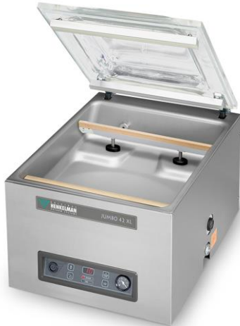
*optional with 2nd seal bar